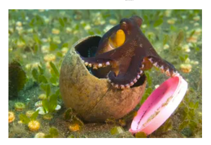
cf. Netflix "My Octopus Teacher"