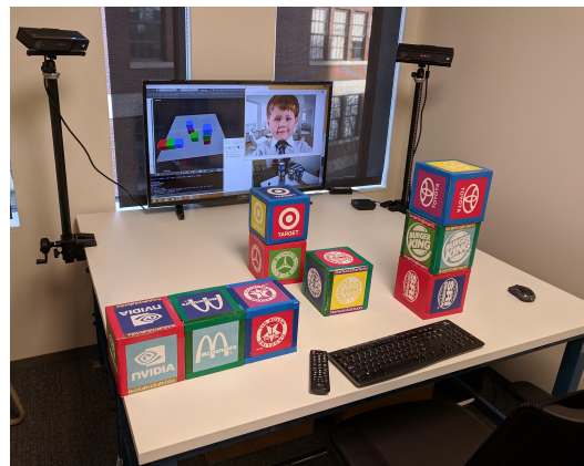
Figure 1: The blocks world apparatus setup.