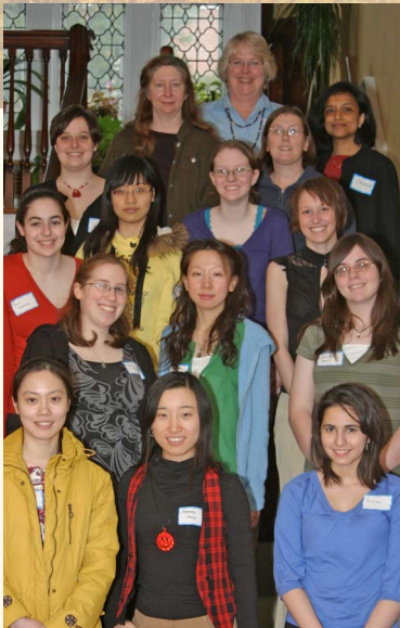
April 4 Ladies Tea at AAUW House