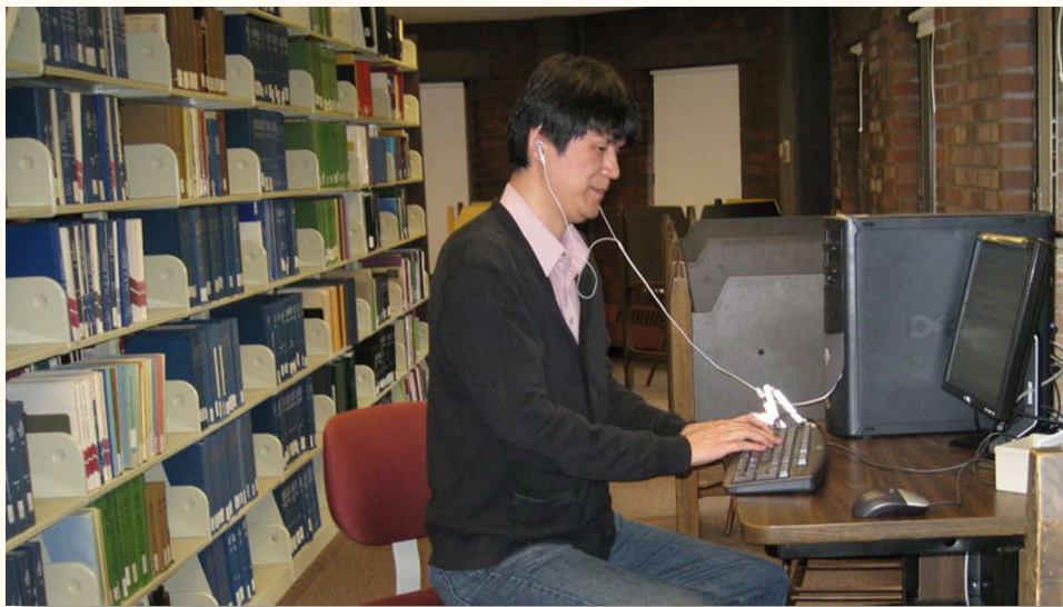
A visually impaired graduate student at the University of Washington uses WebAnywhere to access his email on a computer at a campus library that would otherwise be inaccessible to him.

is excited to continue addressing challenging research questions with the potential for positive social impact once at UR. As such, his projects often lead to large-scale deployments with real world users, which not only enable users to immediately benefit from his research but also give the researchers