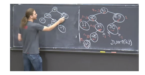
Fig. 1. An instructor demonstrating an AVL tree insertion.

In response, we have developed a direct manipulation (DM) language for tracing the operation of algorithms on example data structures. A visual vocabulary of numbers, lists, binary trees and graphs enables the teacher to setup an example data structure. The DM language provides a mapping from gestures to primitive operations, enabling the teacher to illustrate the concrete trace of an algorithm by manipulating the example data structure.